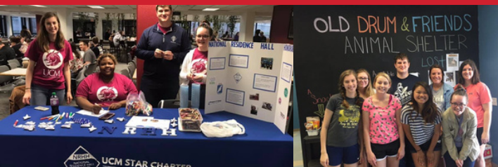
Pictured above (left): NRHH collecting crayons for local Children's Hospital and recycling used markers